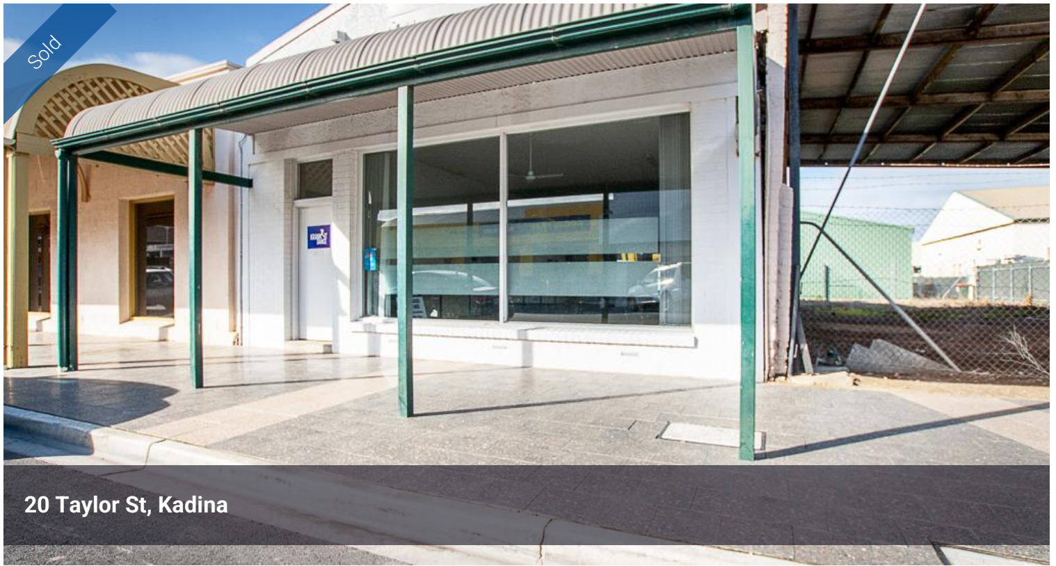
20 Taylor St, Kadina