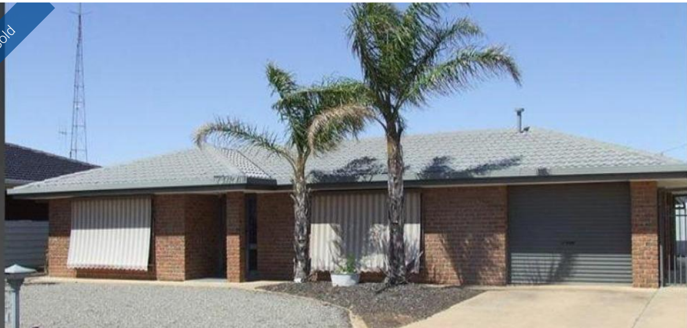
7 Milne Street, Port Pirie