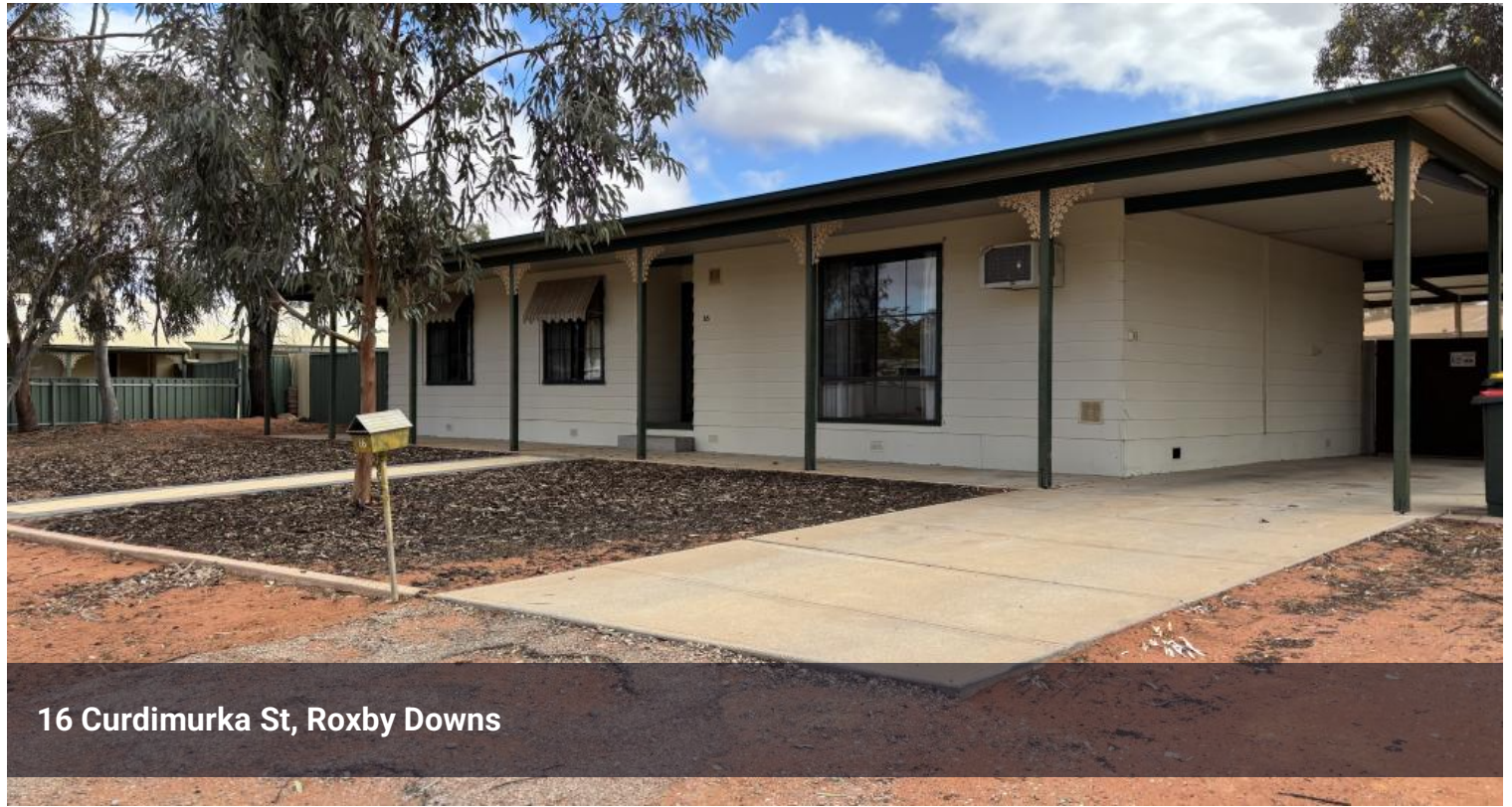
16 Curdimurka St, Roxby Downs