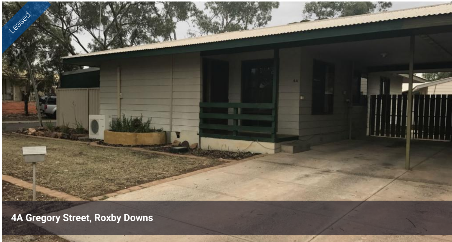
4A Gregory Street, Roxby Downs