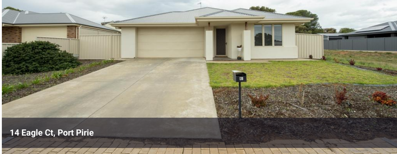
14 Eagle Ct, Port Pirie