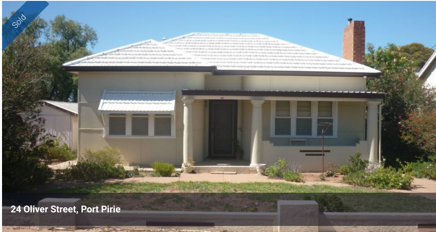
24 Oliver Street, Port Pirie