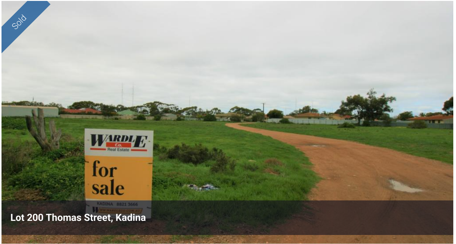
Lot 200 Thomas Street, Kadina