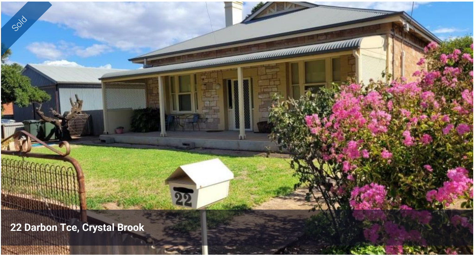
22 Darbon Tce, Crystal Brook