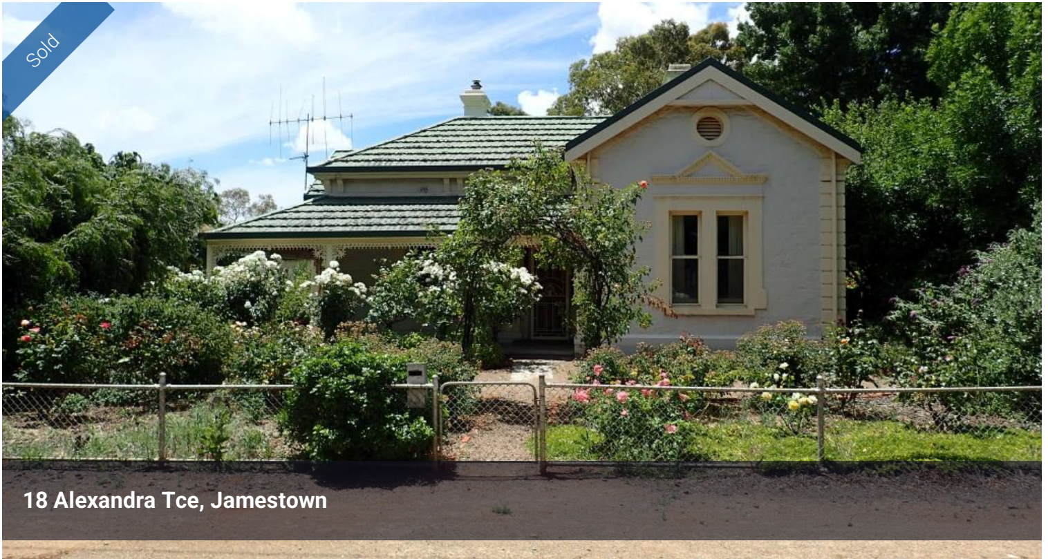
18 Alexandra Tce, Jamestown