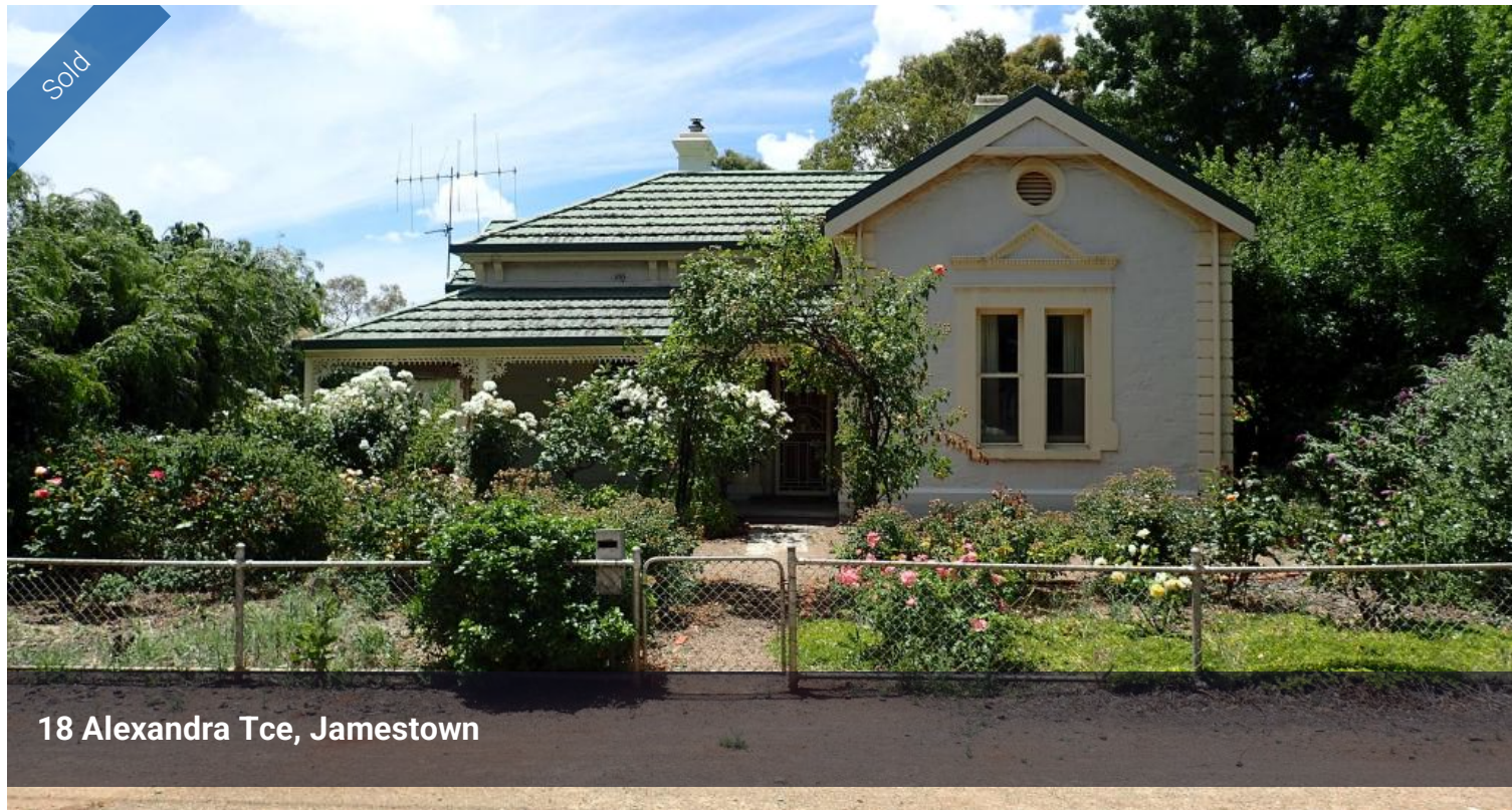
18 Alexandra Tce, Jamestown