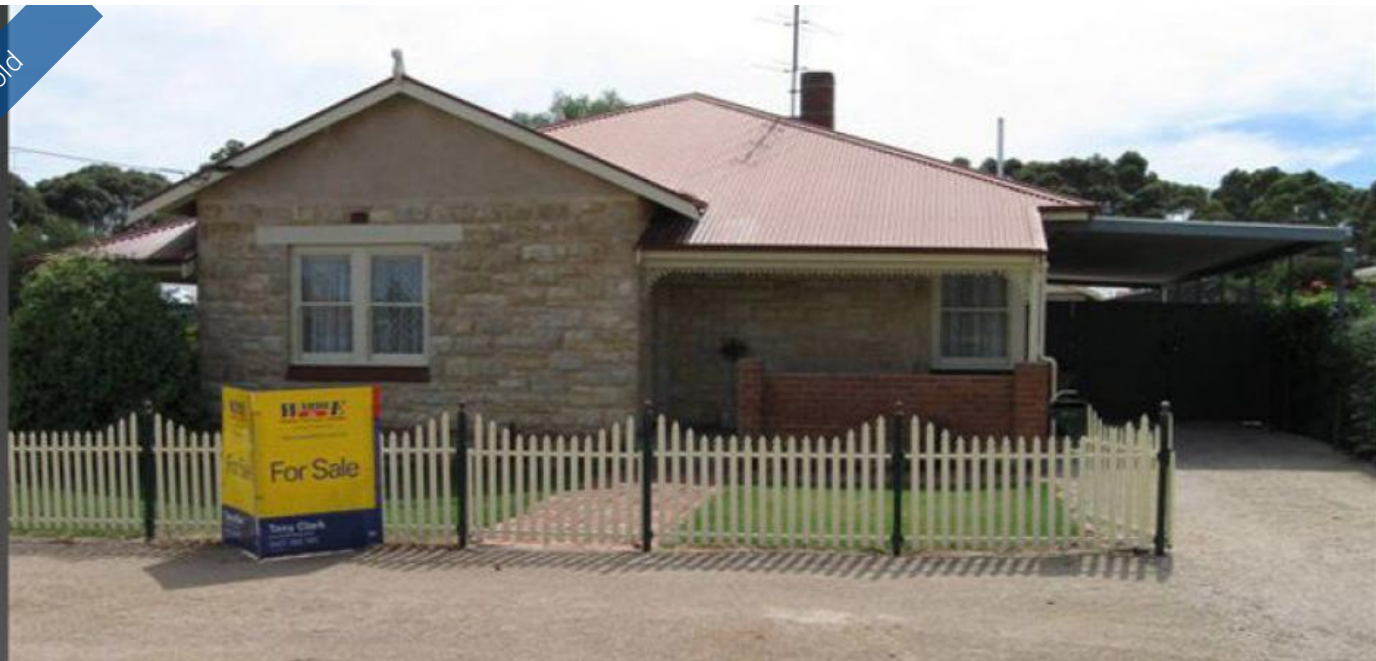
Lot 39-41 Samuel Street, Maitland