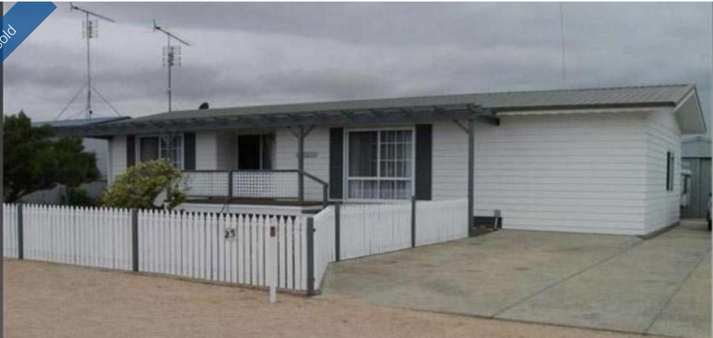
25 Crampton Crescent, Port Victoria