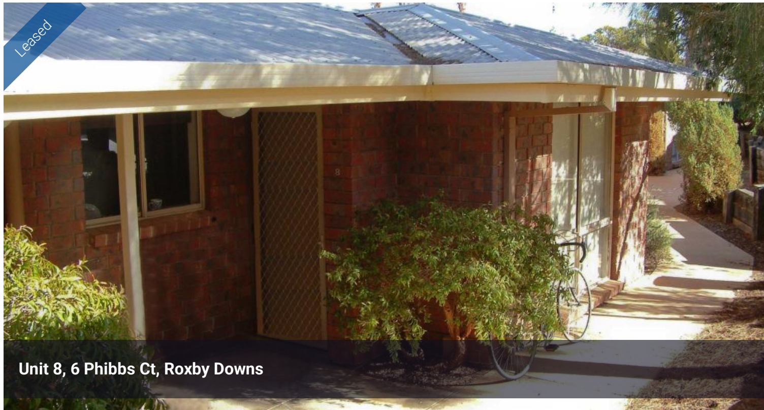
Unit 8, 6 Phibbs Ct, Roxby Downs