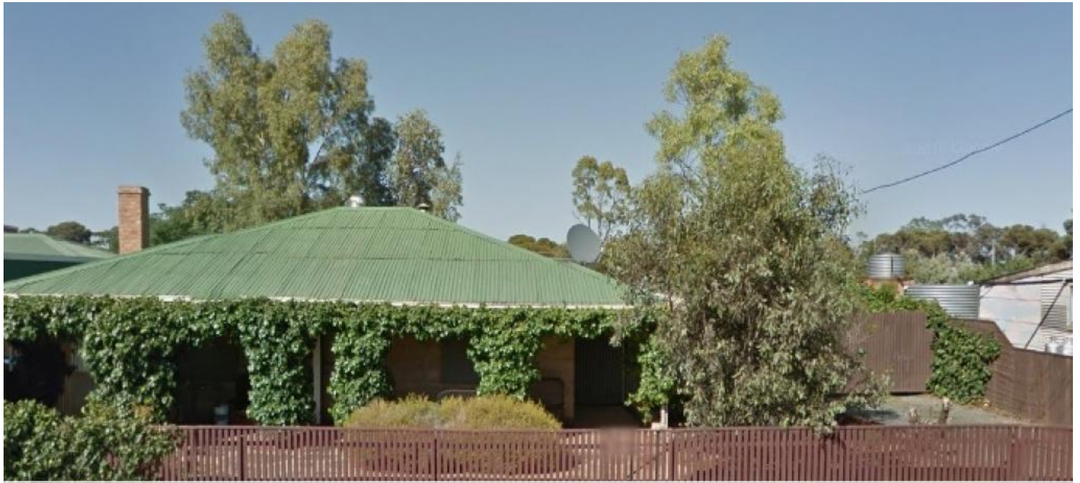
Lot, 63 Main Street, Yunta