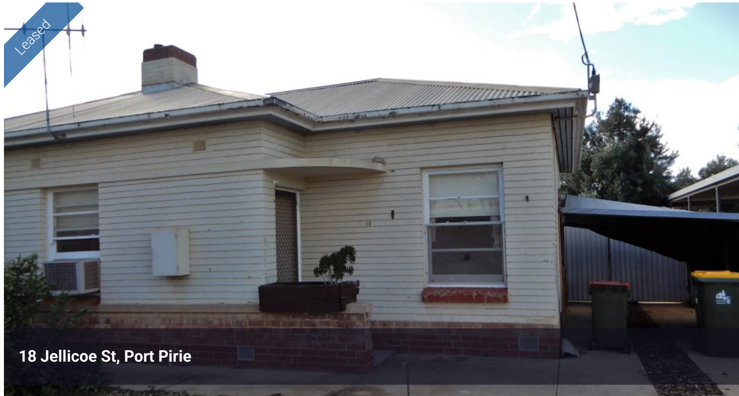
18 Jellicoe St, Port Pirie