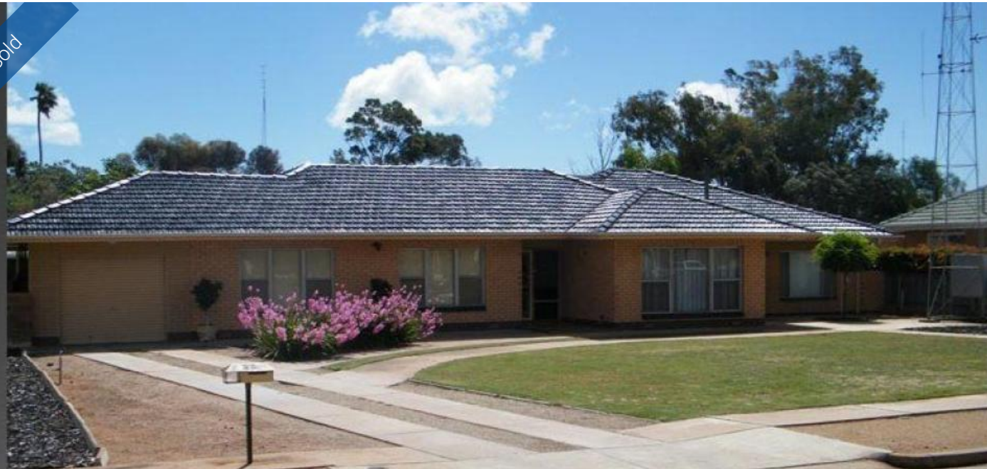
Lot 20 Degenhardt Street, Port Pirie