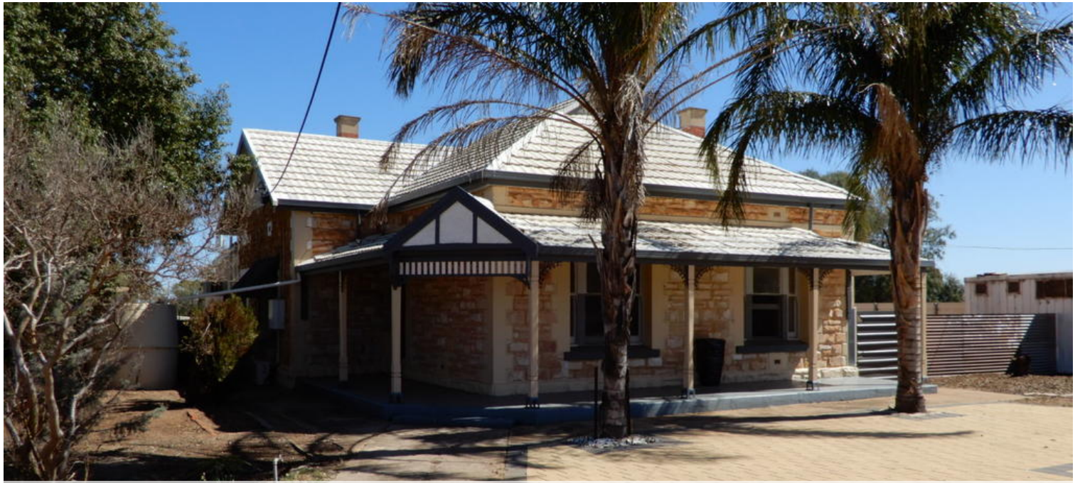
109 Darbon Tce, Crystal Brook