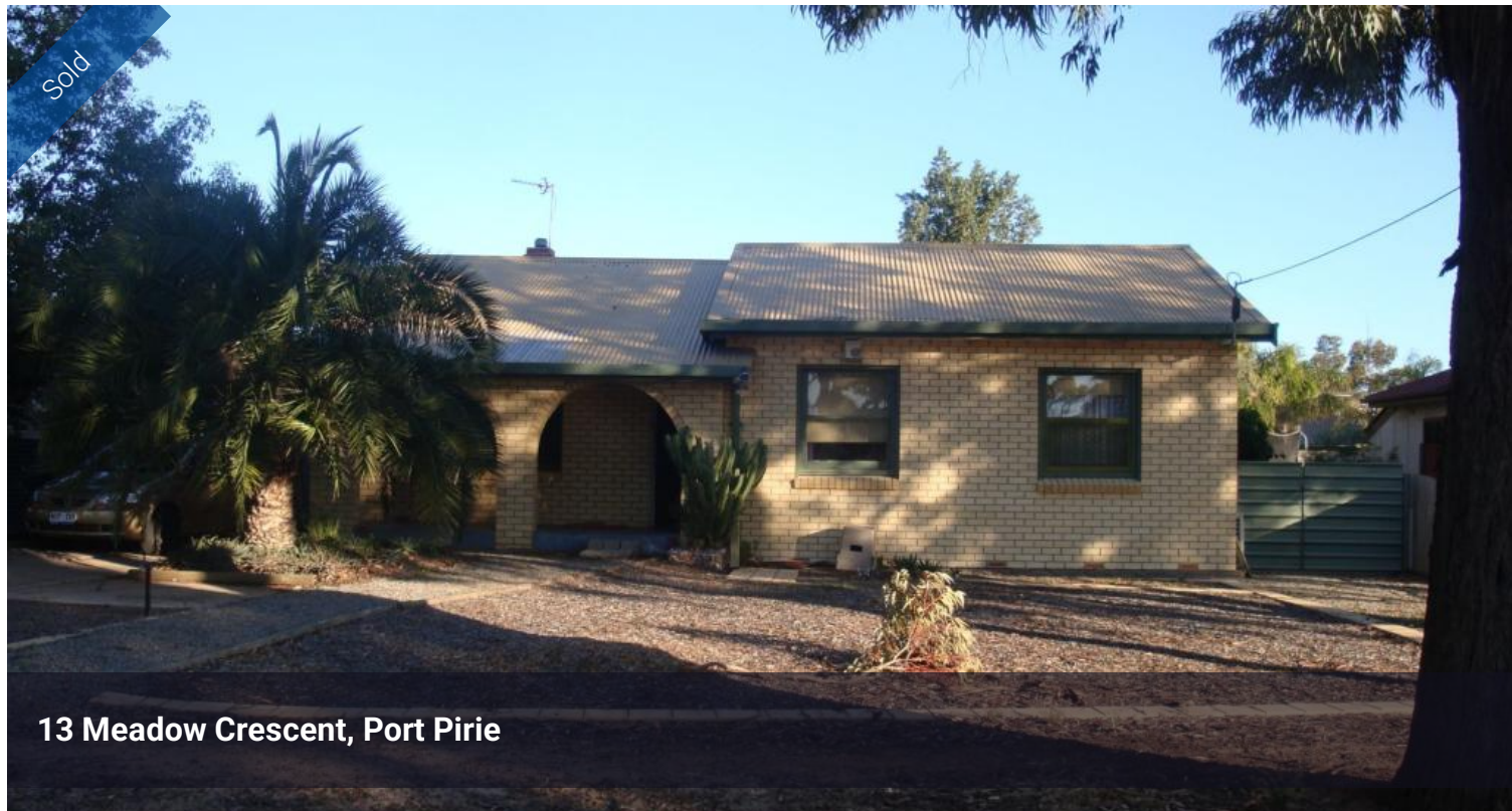
13 Meadow Crescent, Port Pirie