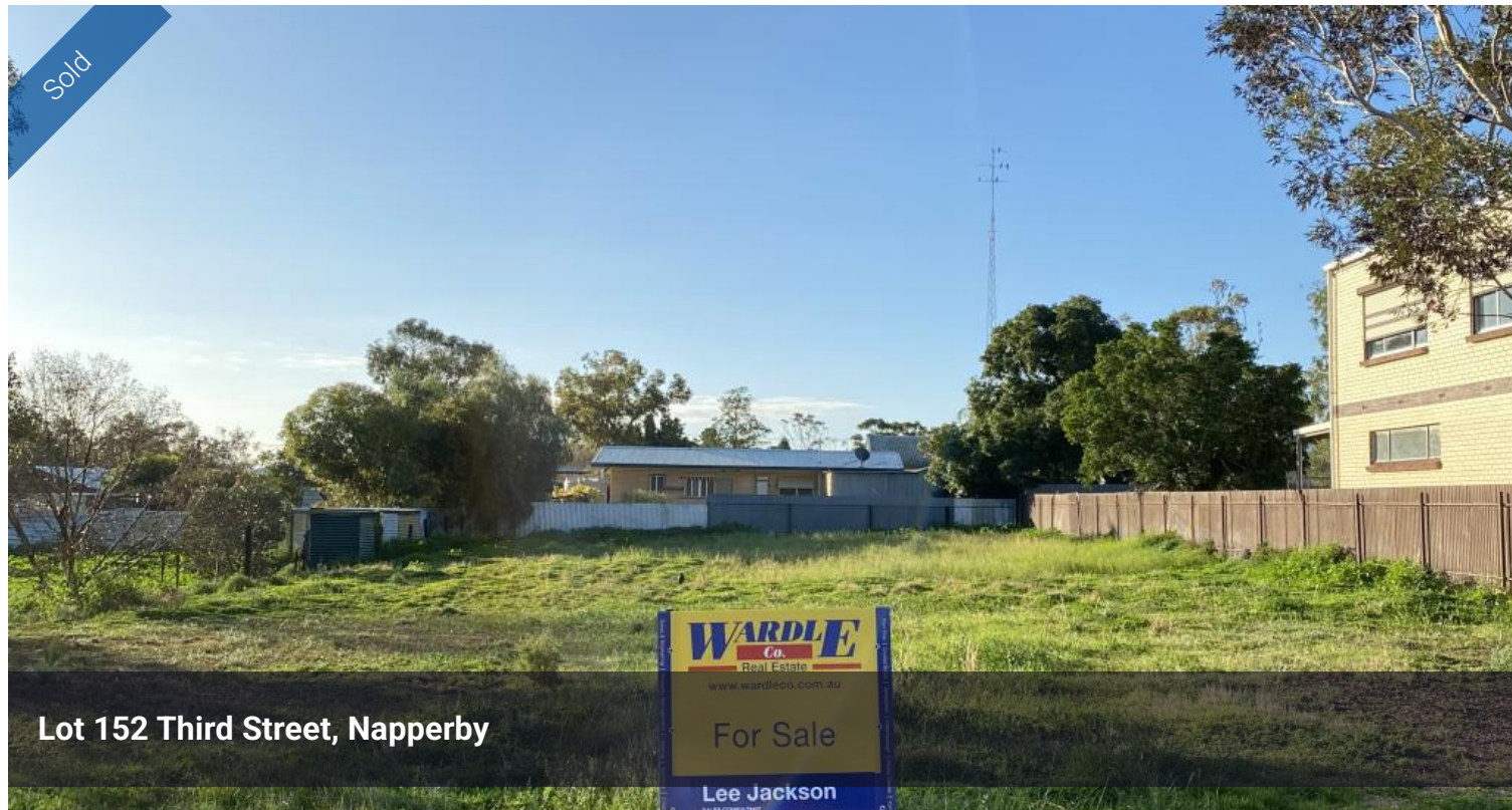
Lot 152 Third Street, Napperby