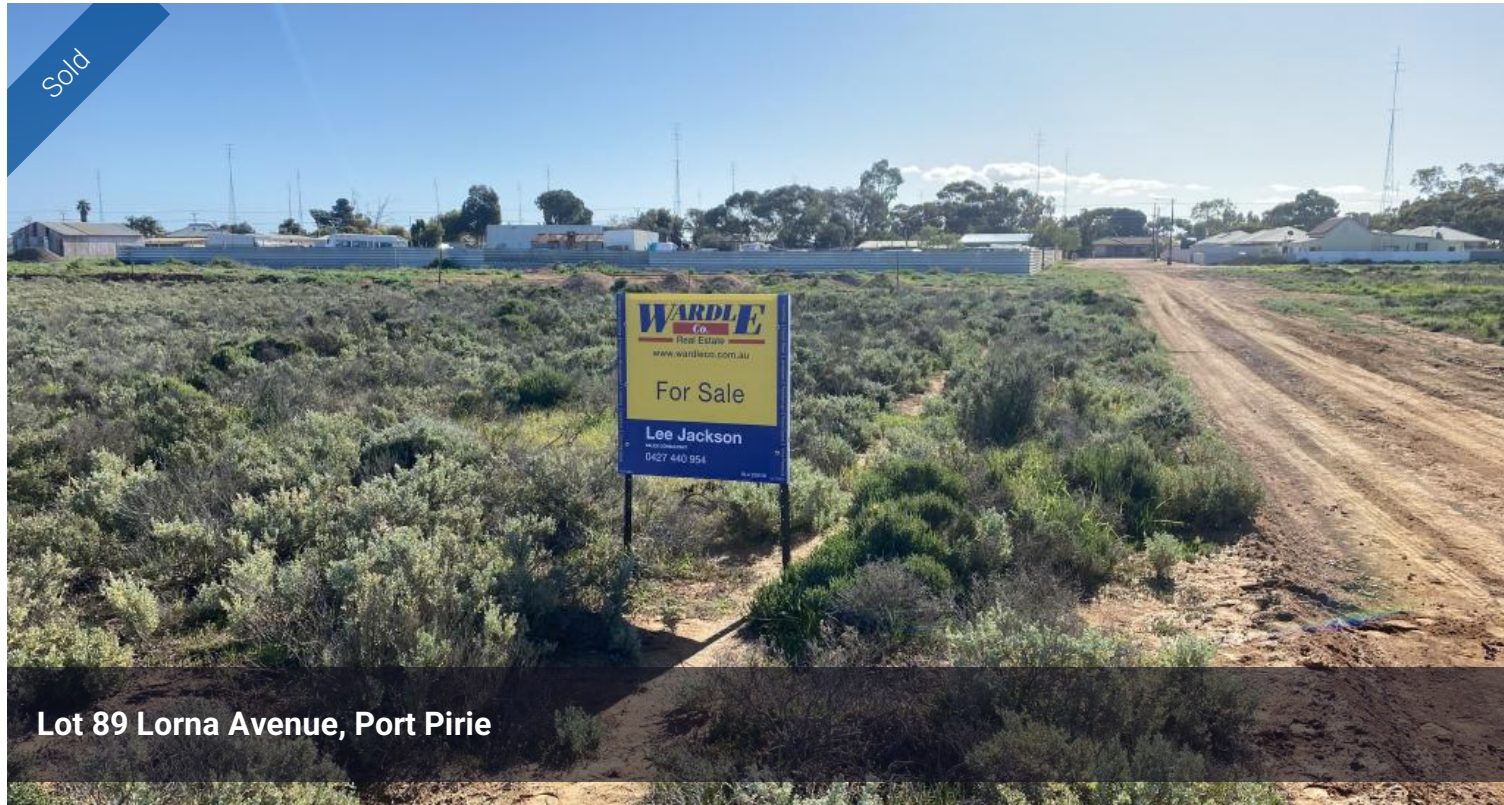
Lot 89 Lorna Avenue, Port Pirie