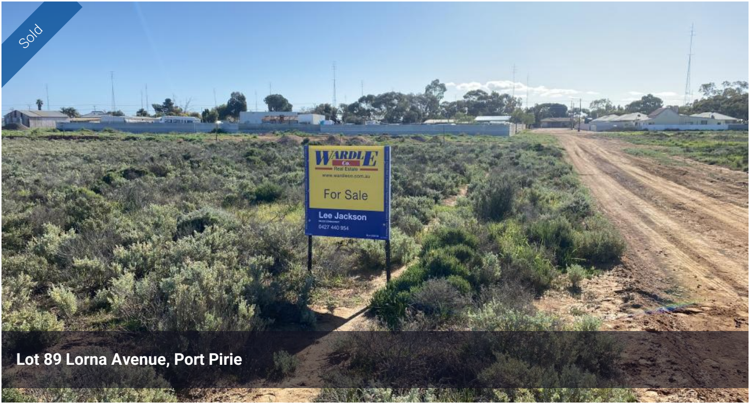
Lot 89 Lorna Avenue, Port Pirie