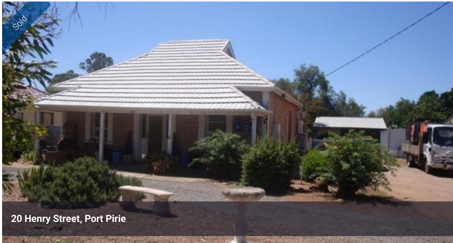
20 Henry Street, Port Pirie