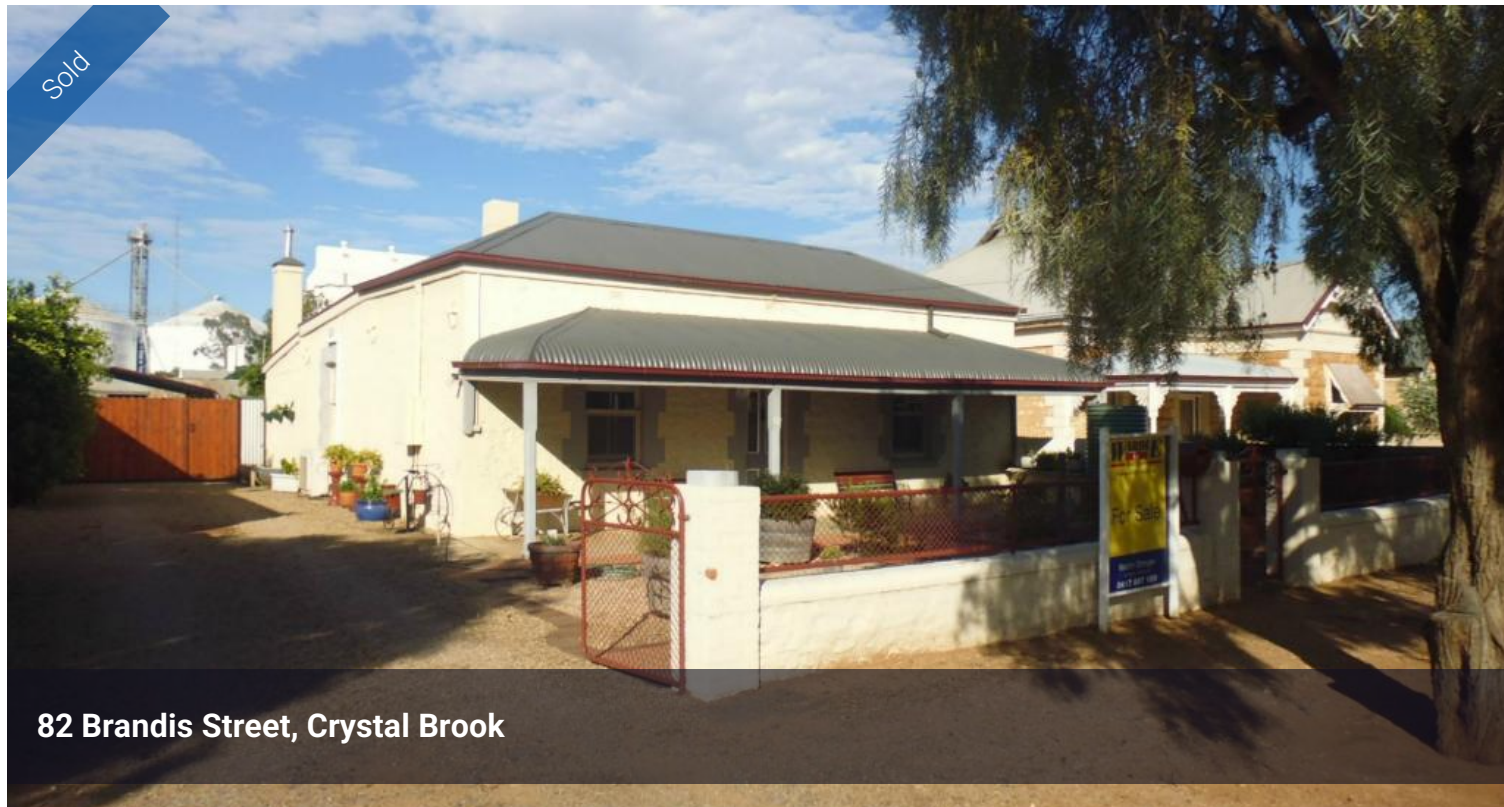
82 Brandis Street, Crystal Brook