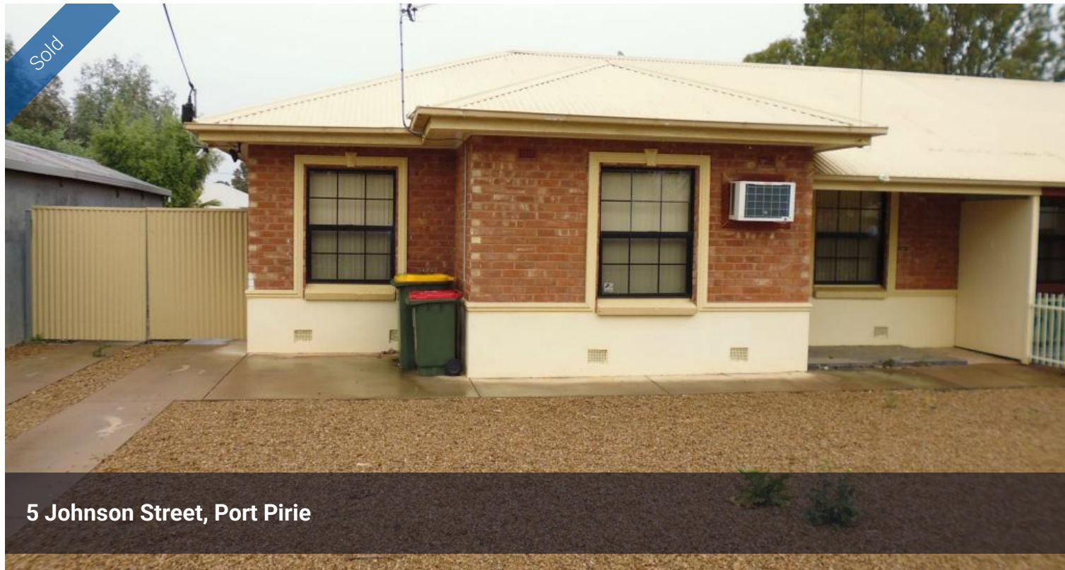
5 Johnson Street, Port Pirie