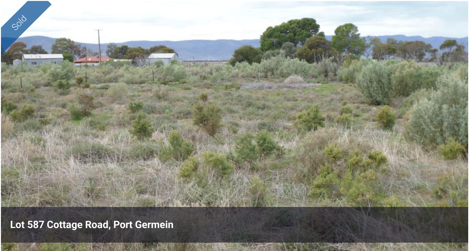
Lot 587 Cottage Road, Port Germein