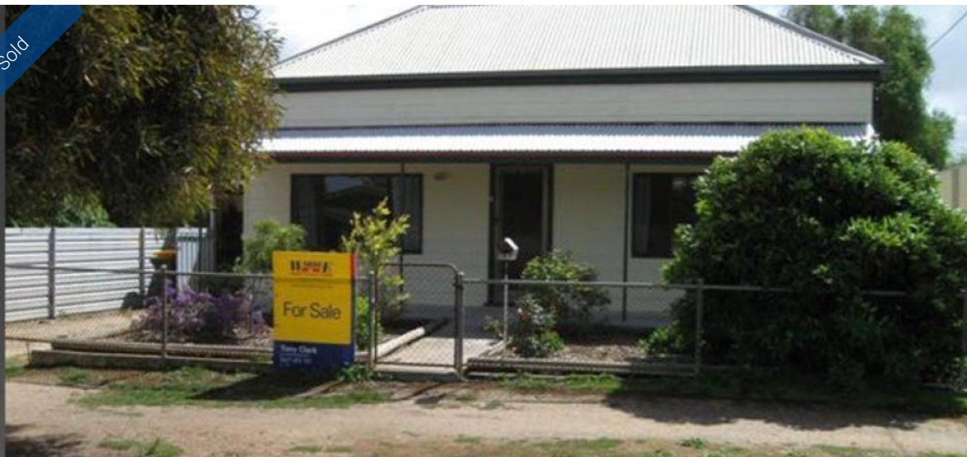
Lot 7 Elizabeth Street, Maitland