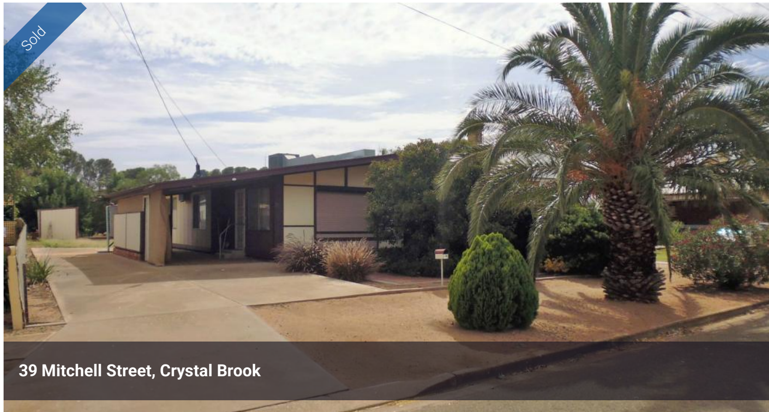
39 Mitchell Street, Crystal Brook