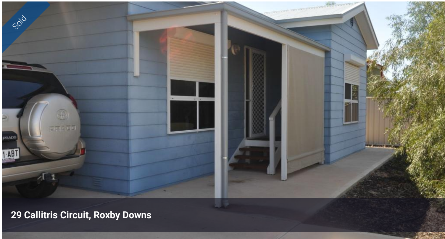
29 Callitris Circuit, Roxby Downs