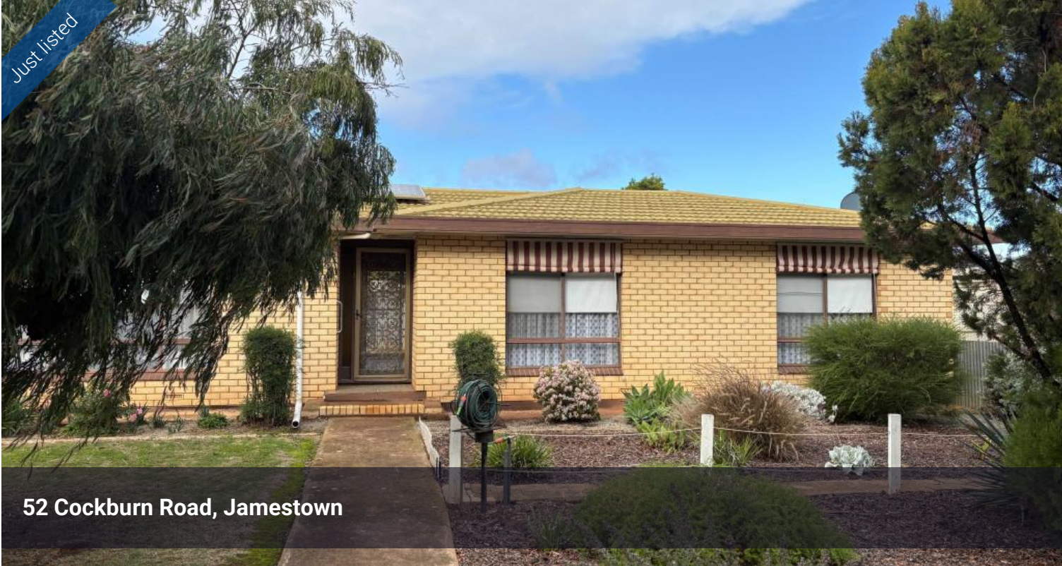
52 Cockburn Road, Jamestown