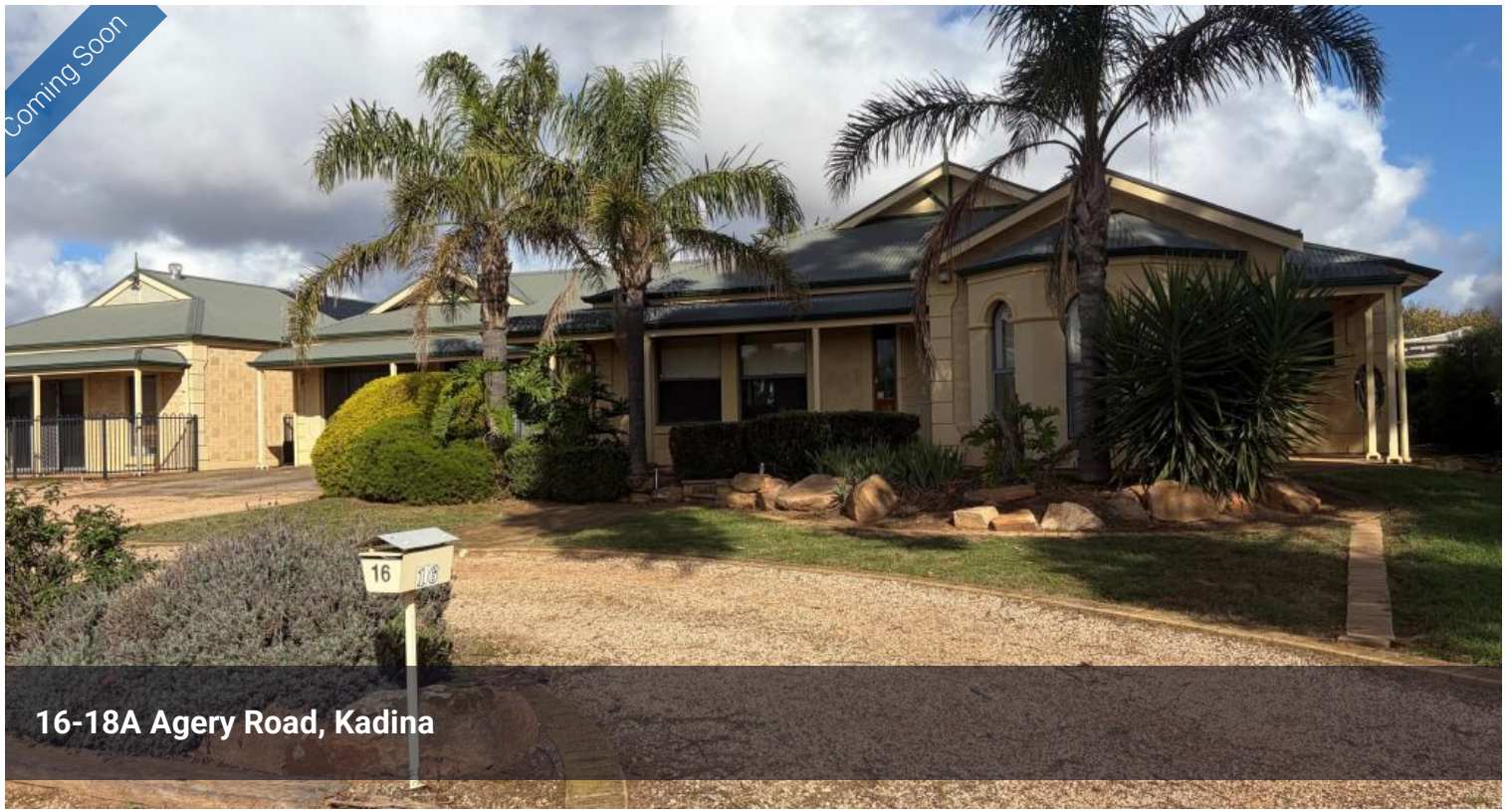
16-18A Agery Road, Kadina