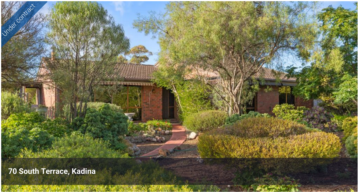
70 South Terrace, Kadina