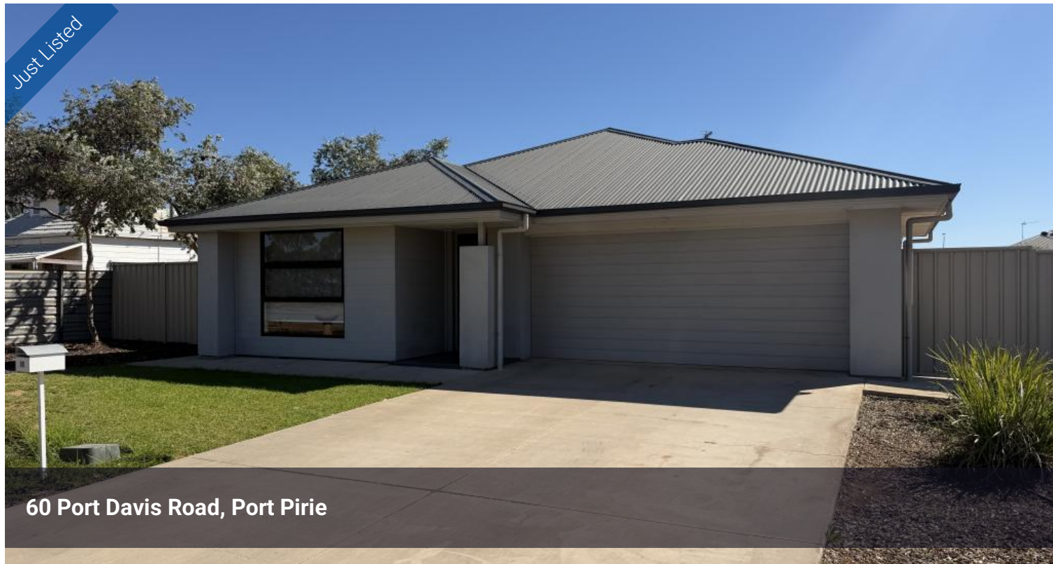
60 Port Davis Road, Port Pirie