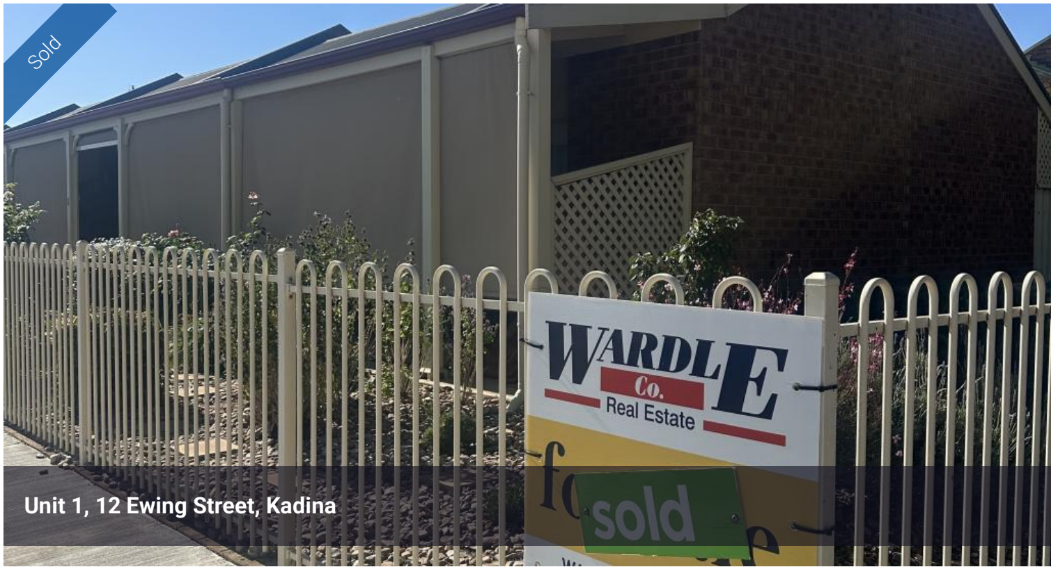
Unit 1, 12 Ewing Street, Kadina