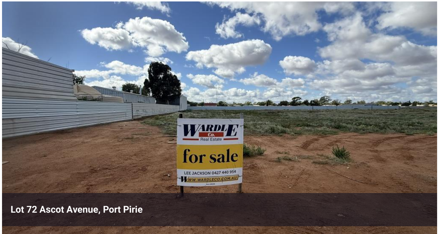
Lot 72 Ascot Avenue, Port Pirie