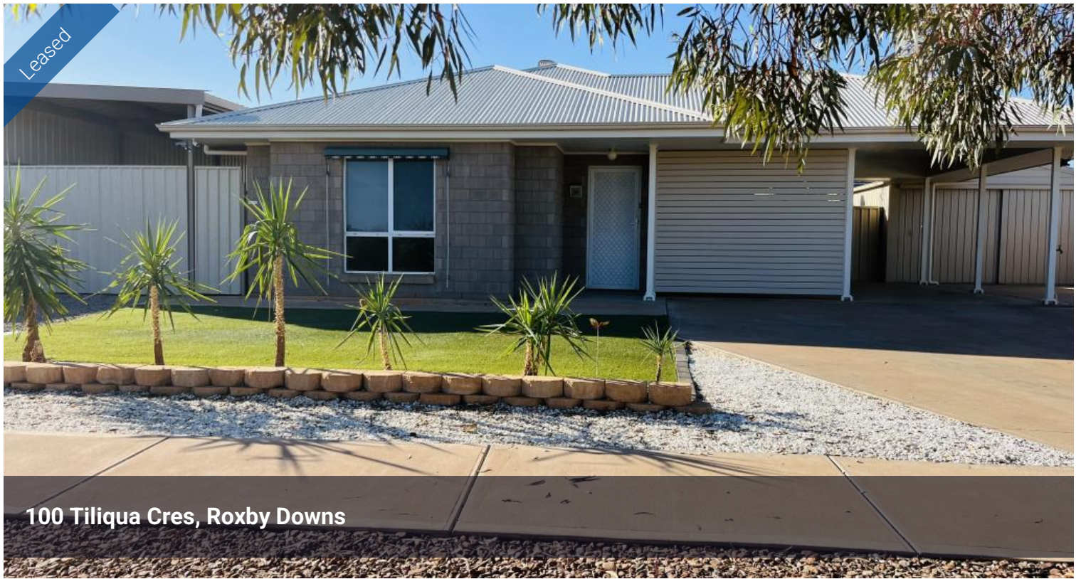
100 Tiliqua Cres, Roxby Downs