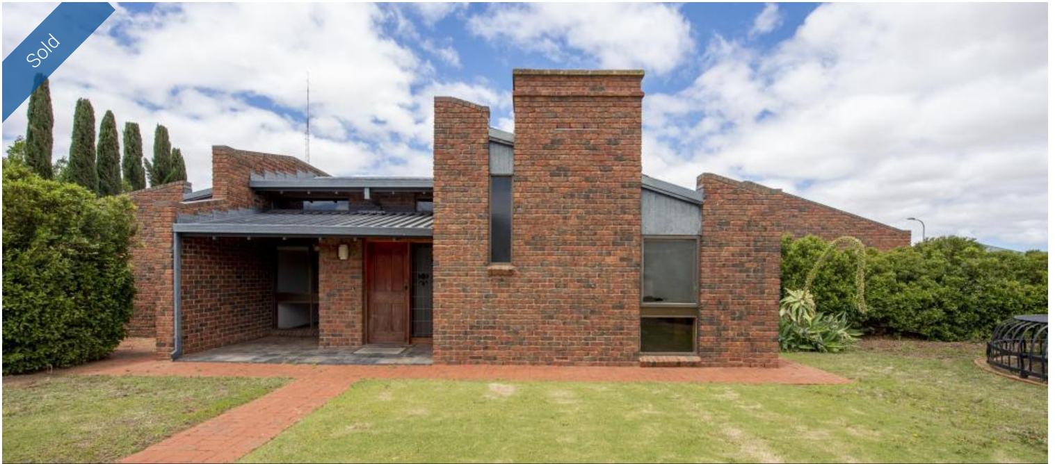
11 Acacia Street, Port Pirie