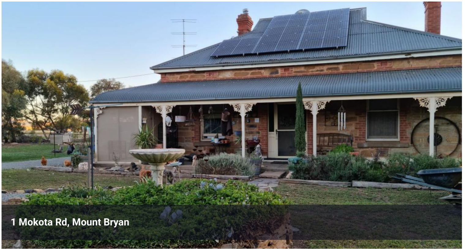
1 Mokota Rd, Mount Bryan