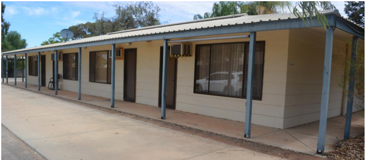
Unit 6, 6-8 Kennebery St, Roxby Downs