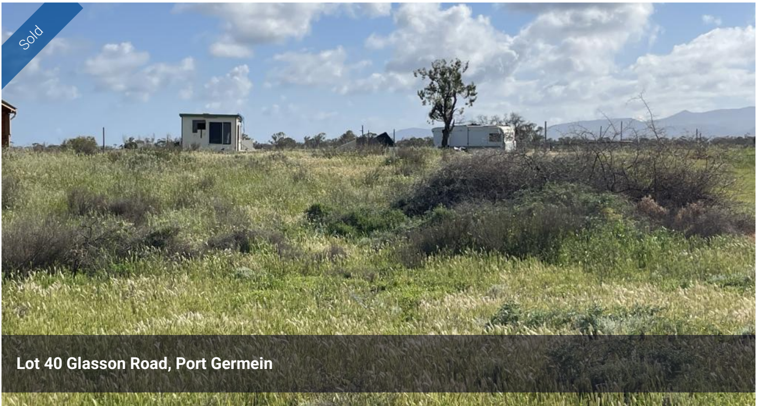
Lot 40 Glasson Road, Port Germein