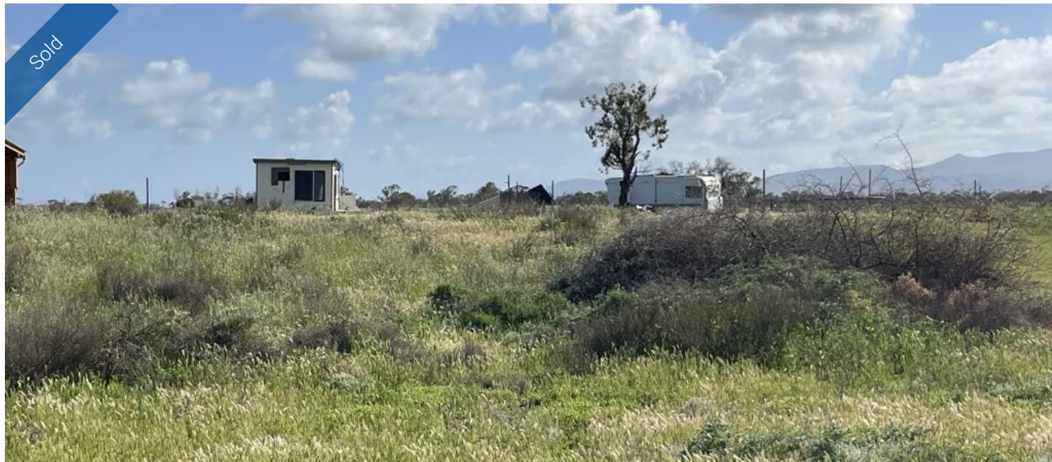
Lot 40 Glasson Road, Port Germein