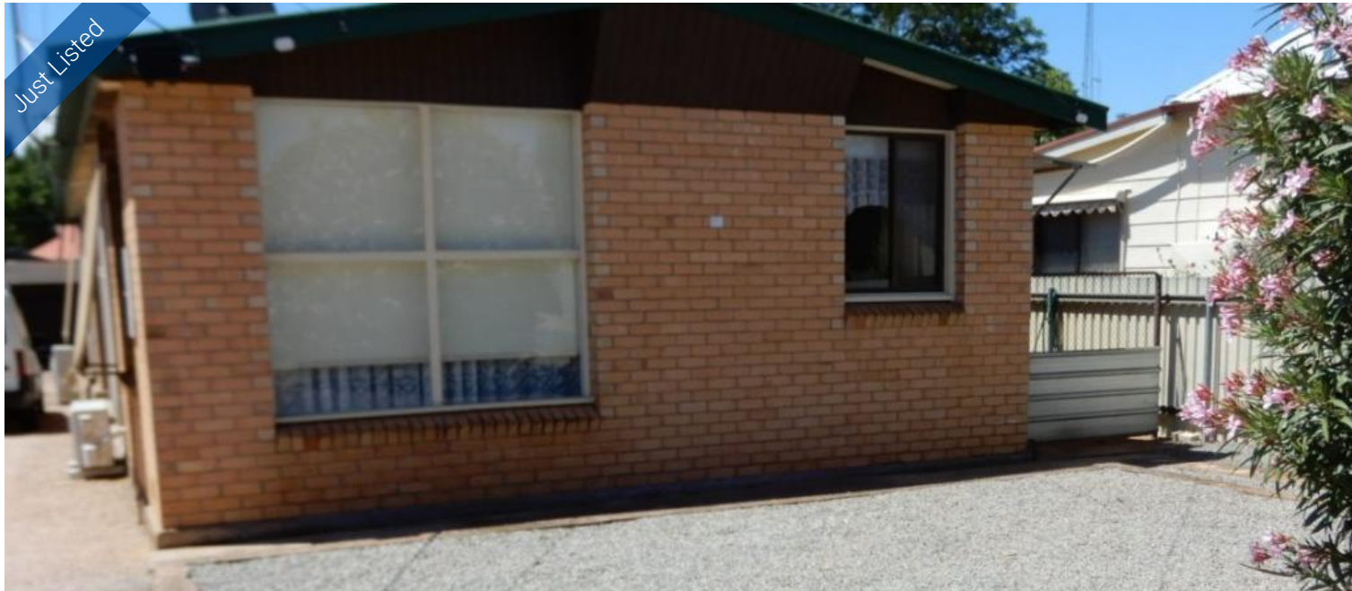
Unit 1, 24 Ronald St, Port Pirie