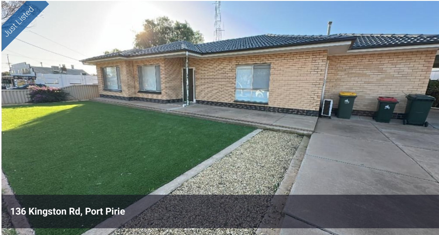
136 Kingston Rd, Port Pirie