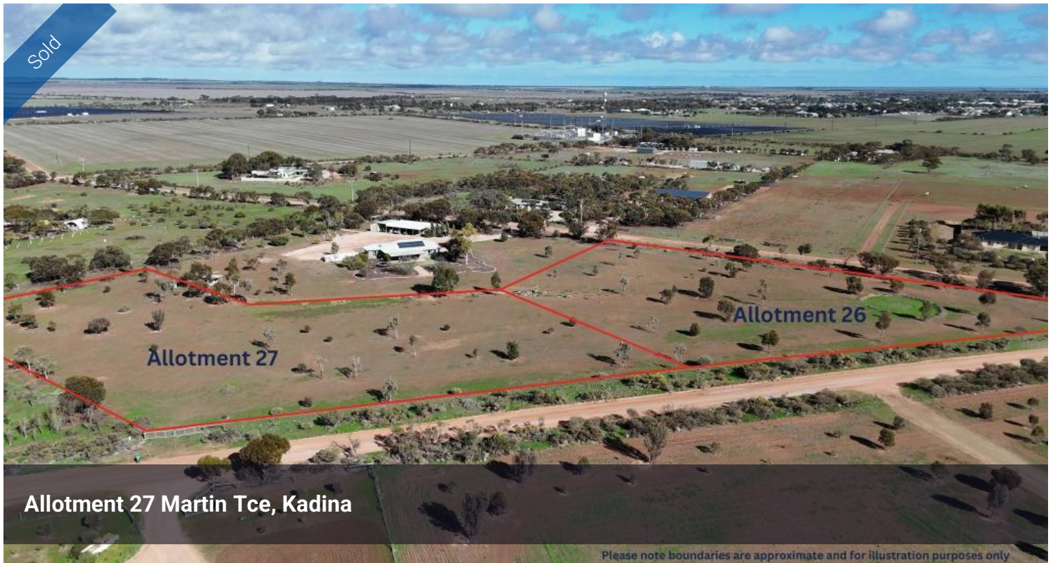
Allotment 27 Martin Tce, Kadina

Please note boundaries are approximate and for illustration purposes only