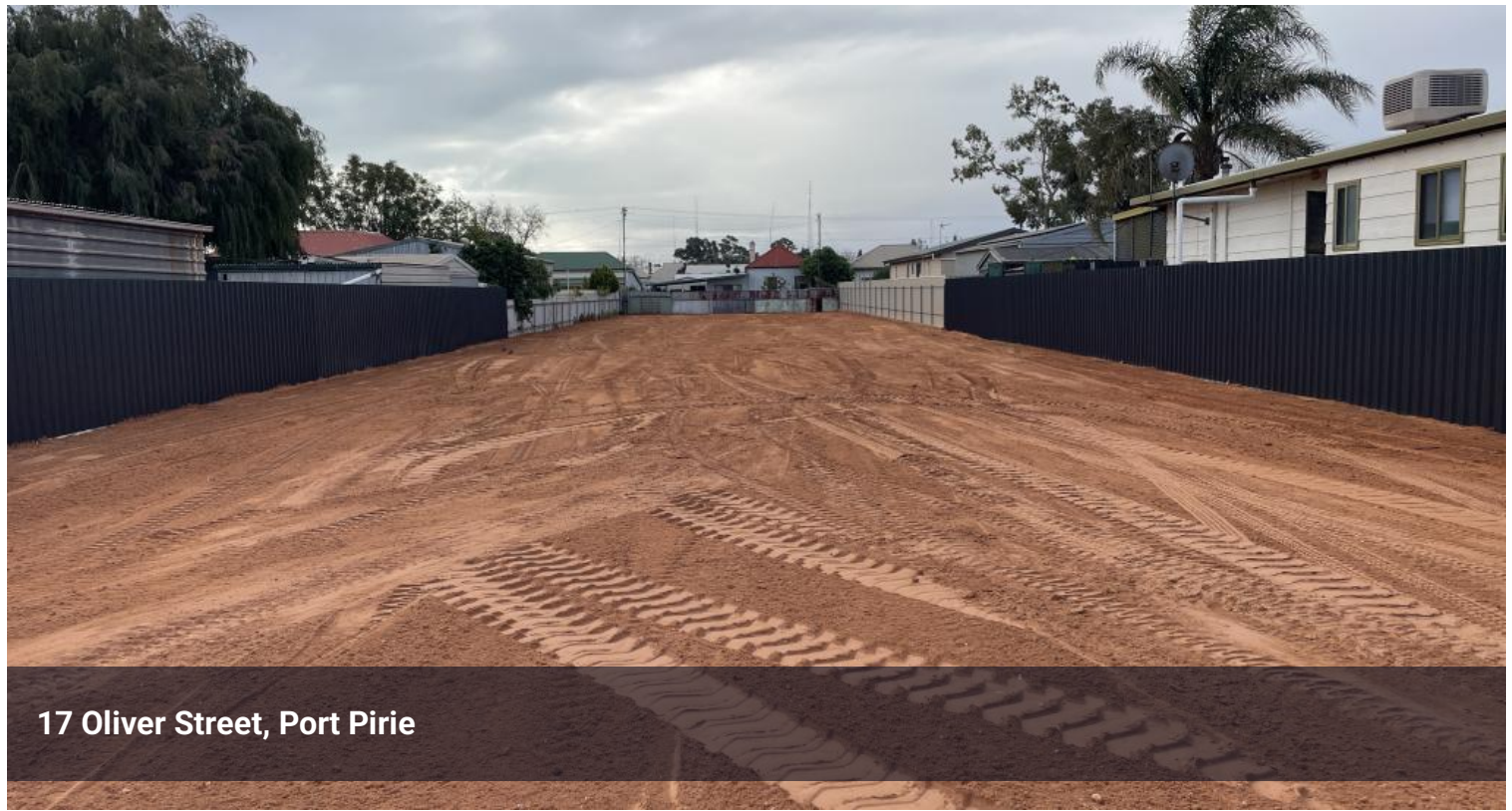
17 Oliver Street, Port Pirie