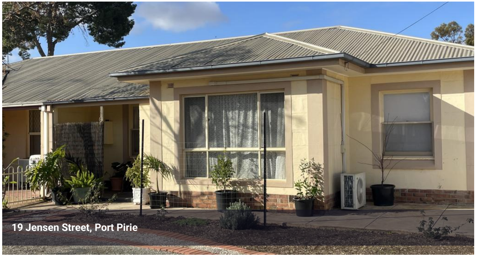
19 Jensen Street, Port Pirie