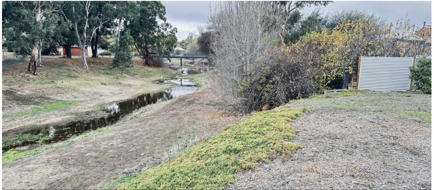
5 Upper Thames St, Burra