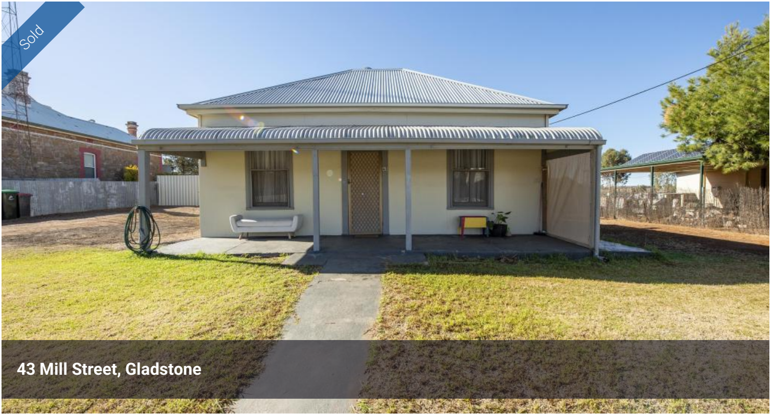
43 Mill Street, Gladstone