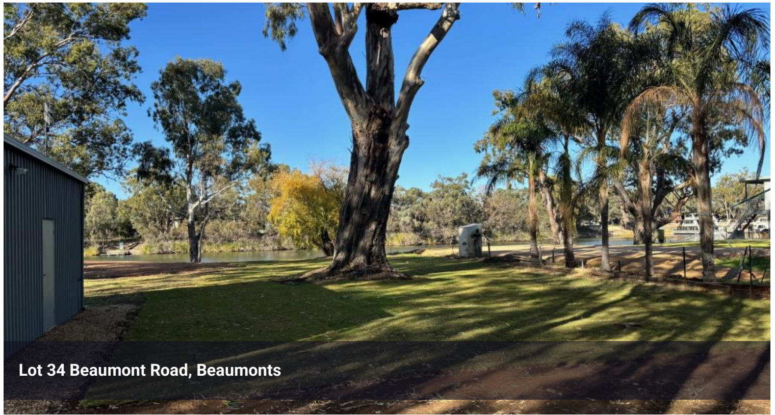
Lot 34 Beaumont Road, Beaumonts