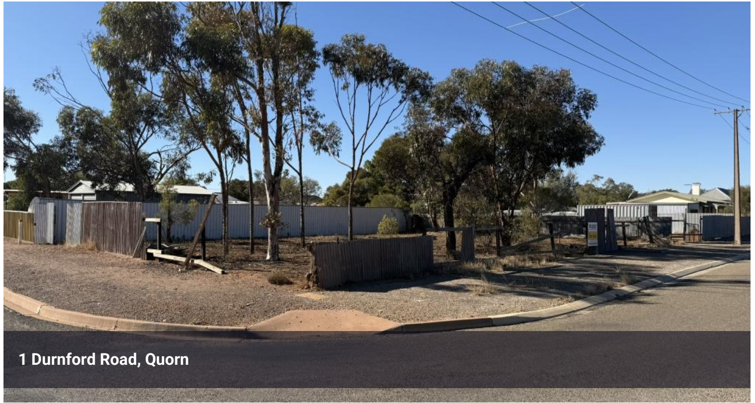
1 Durnford Road, Quorn