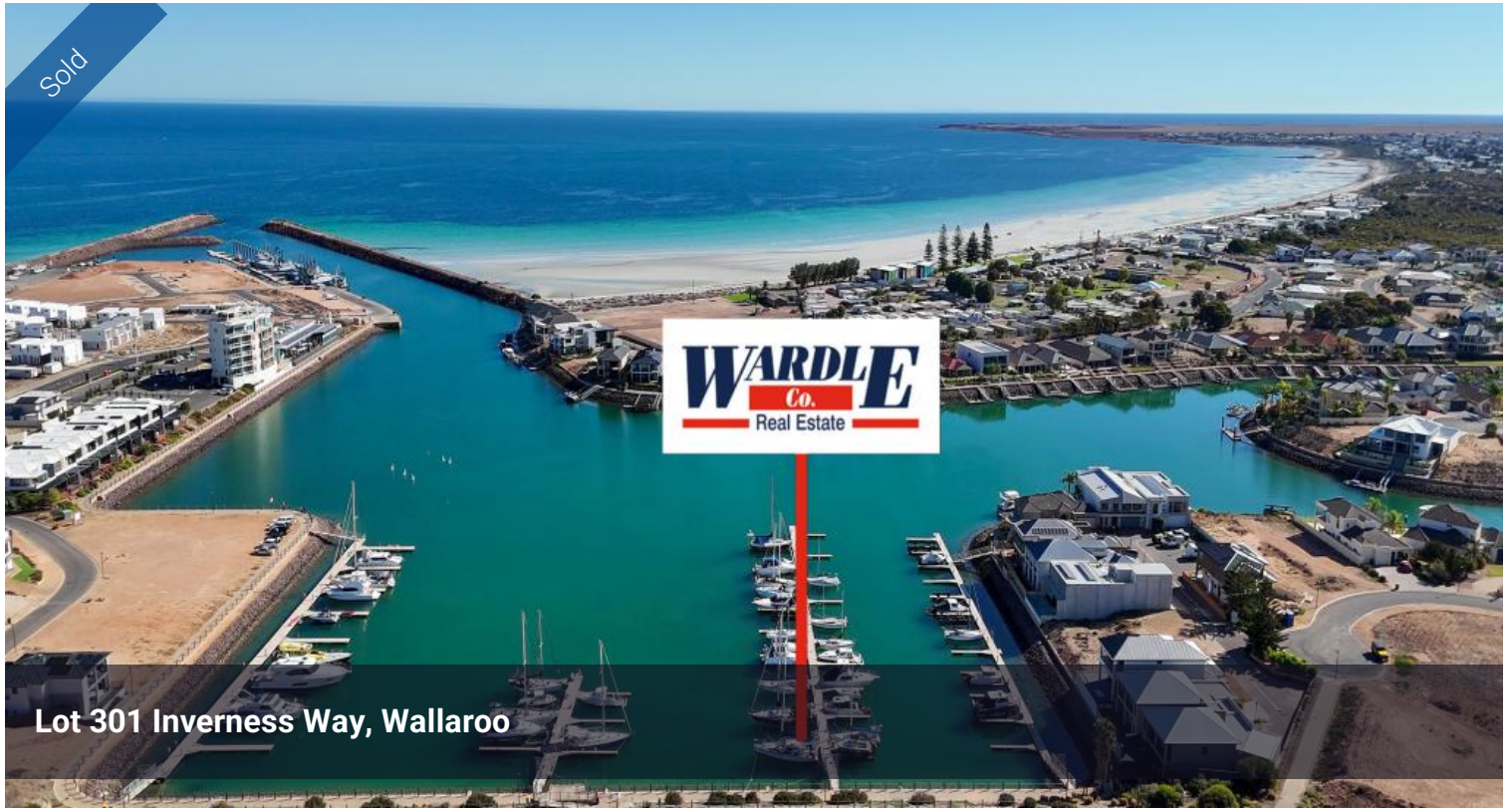
Lot 301 Inverness Way, Wallaroo