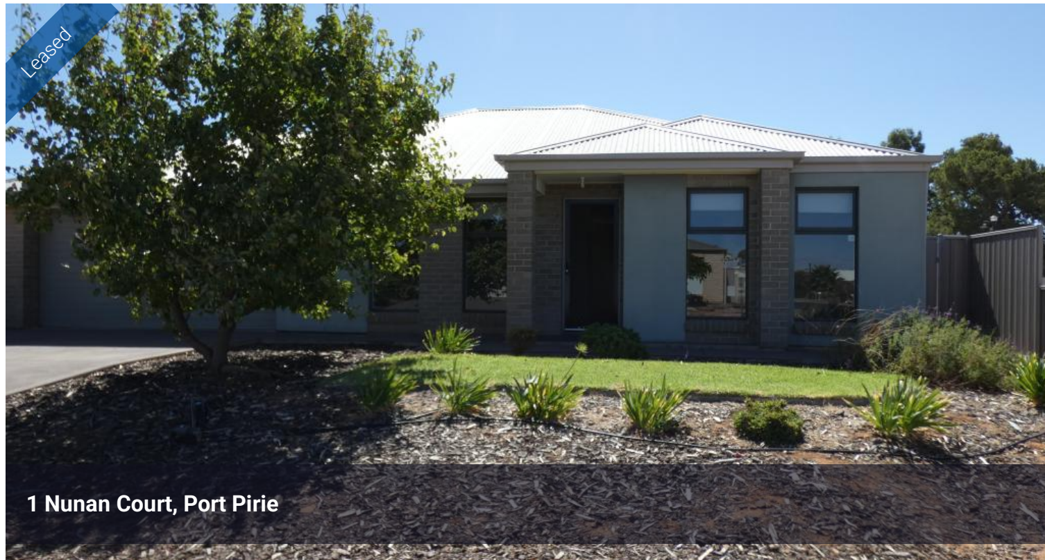
1 Nunan Court, Port Pirie