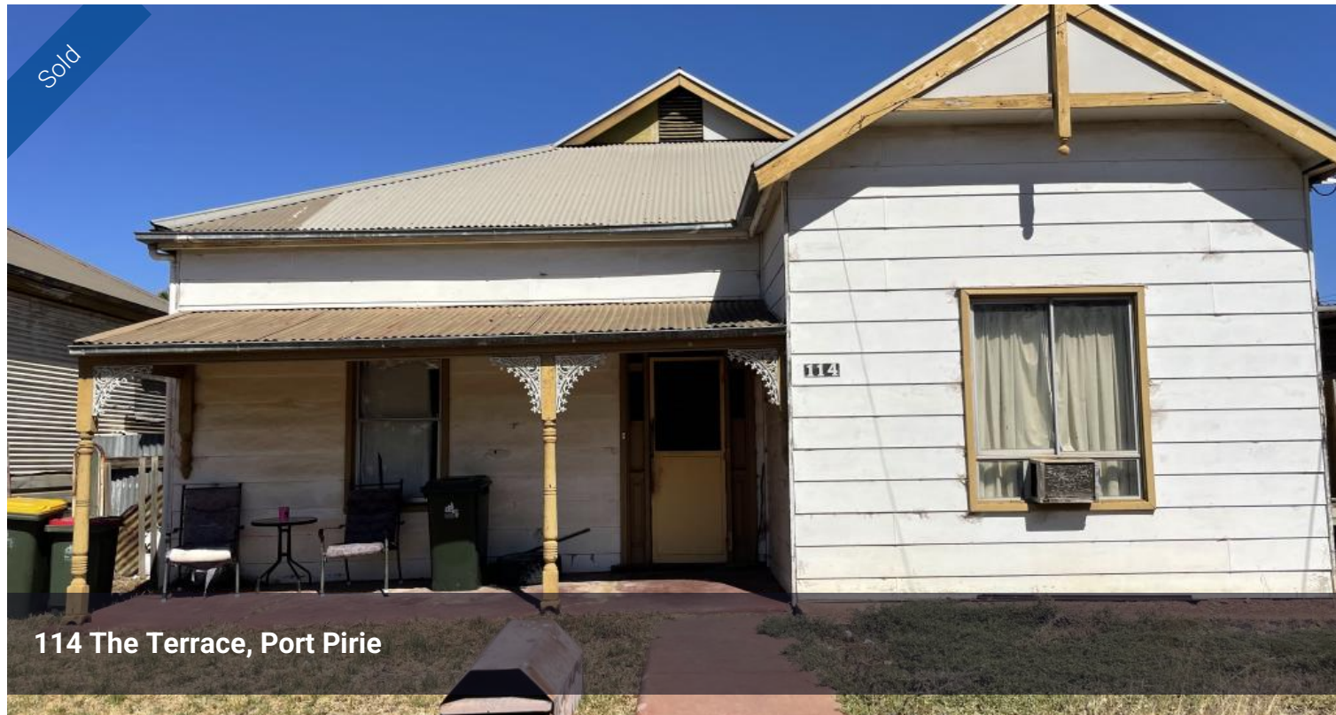
114 The Terrace, Port Pirie