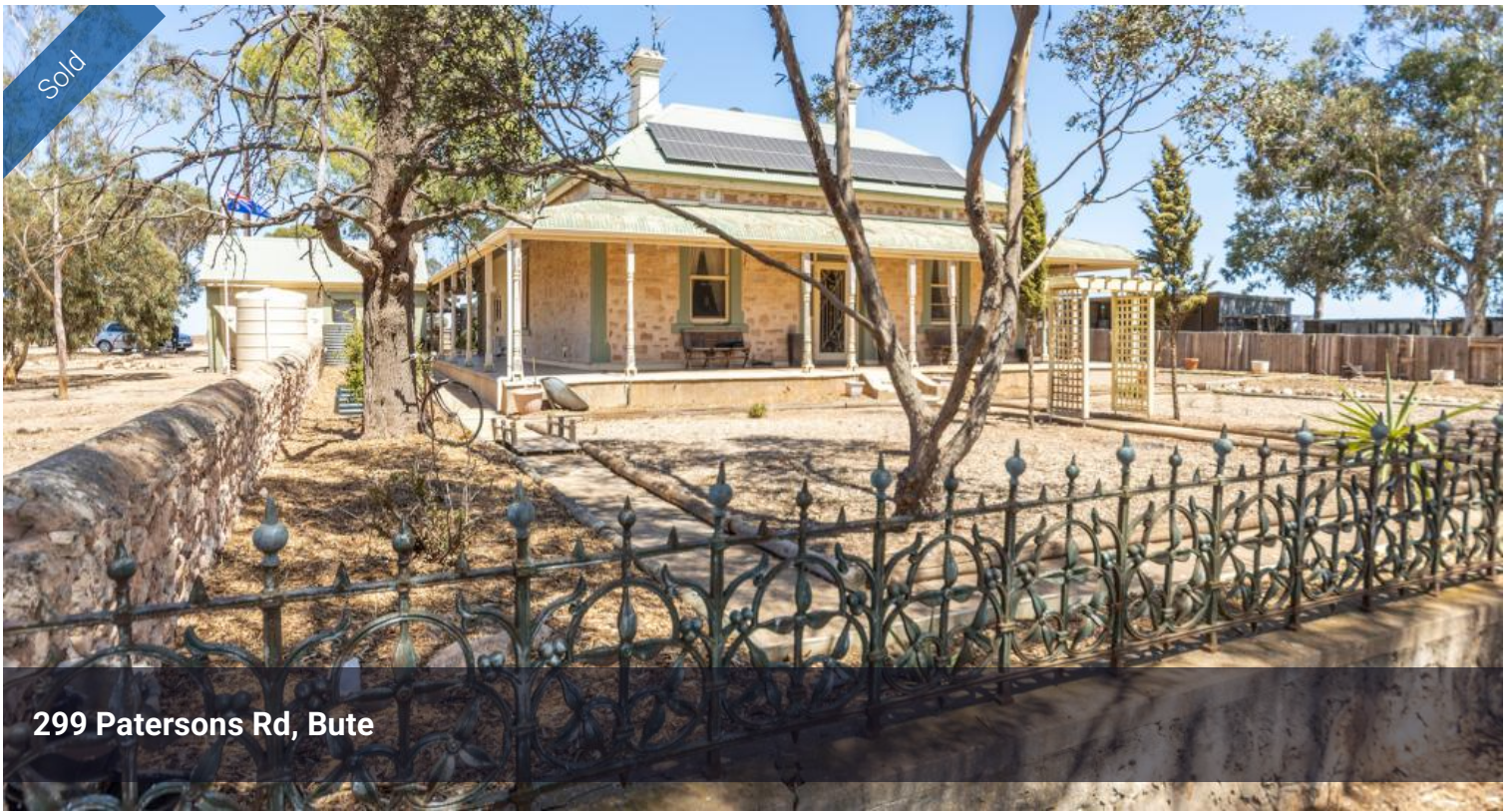
299 Patersons Rd, Bute